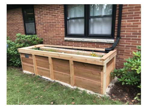
FIGURE 2. STORMGUARDEN CAN BE PARALLEL TO BUILDING WITH NO BASEMENT

* Because the nature of the device is to collect rainwater, the installation needs to take place either directly adjacent to or within arm's reach of a downspout or sump pump. Installation area, adjacent to downspout or sump pump, is either grass or dirt. In some cases, an installation may be done on a hard surface such as a patio, but this is not preferred.