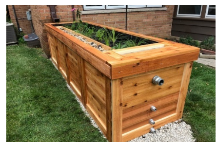
FIGURE 1. STORMGUARDEN PERPENDICULAR FROM BUILDING WITH BASEMENT

Step 5: Congratulations on making it to Step 5! Visit <a href="www.stormGUARDen.com">www.stormGUARDen.com</a> to purchase your installation or DIY Kit!